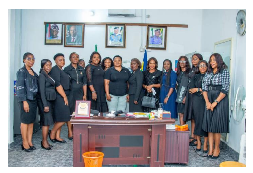
NIGERIAN BAR ASSOCIATION, PORT HARCOURT BRANCH